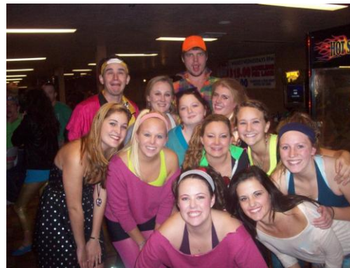
80s Theme Party