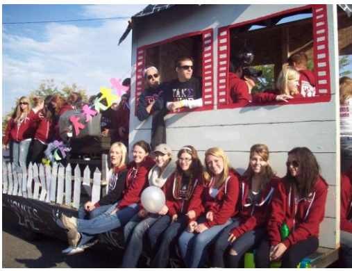
Chapter women riding on the 2011 Homecoming float with Sigma Phi Epsilons and Phi Deltas.